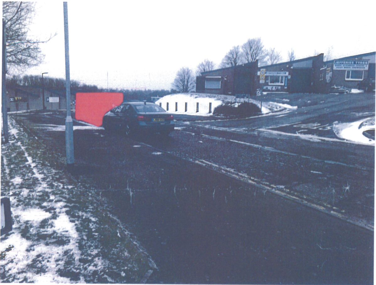
This is our proposed site on Sugarbrooke Rd The exact spot is just in front of where this BMW is parked (red mark)