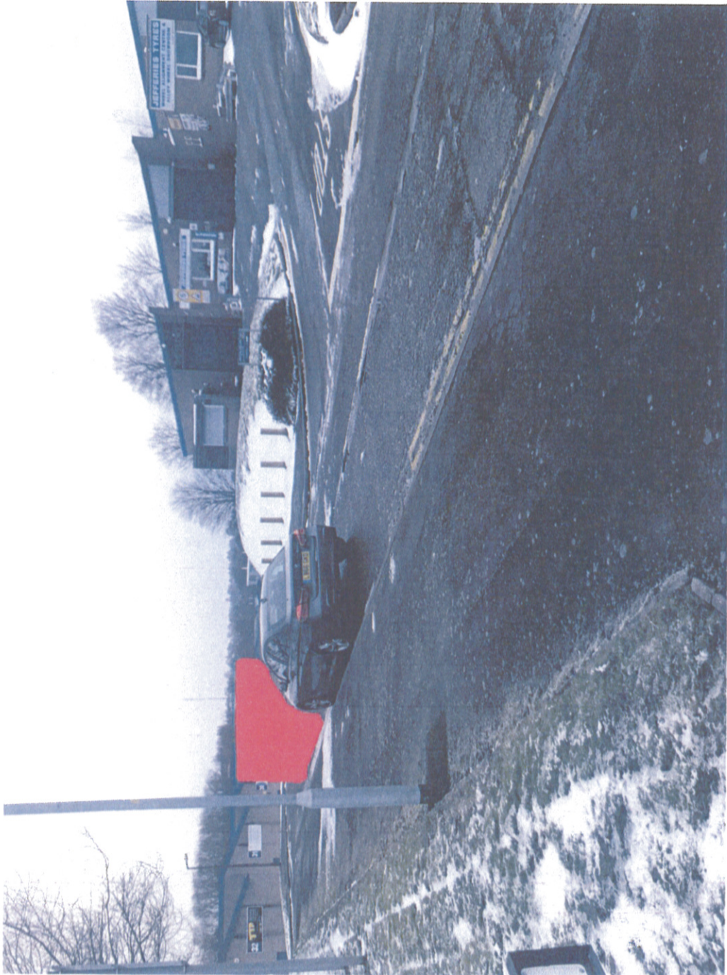
This is our proposed site on Sugarbrooke Rd The exact spot is just in front of where this BMW is parked (red mark)